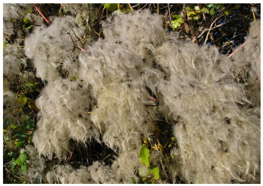
Above: OMB in seed (Winter).