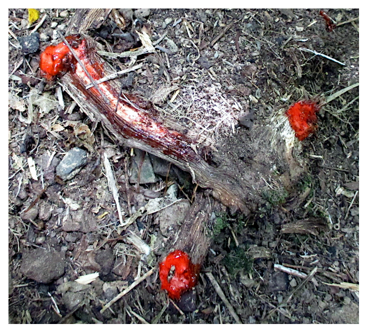
Above: OMB trimmed to ground level and pasted with red Picloram.